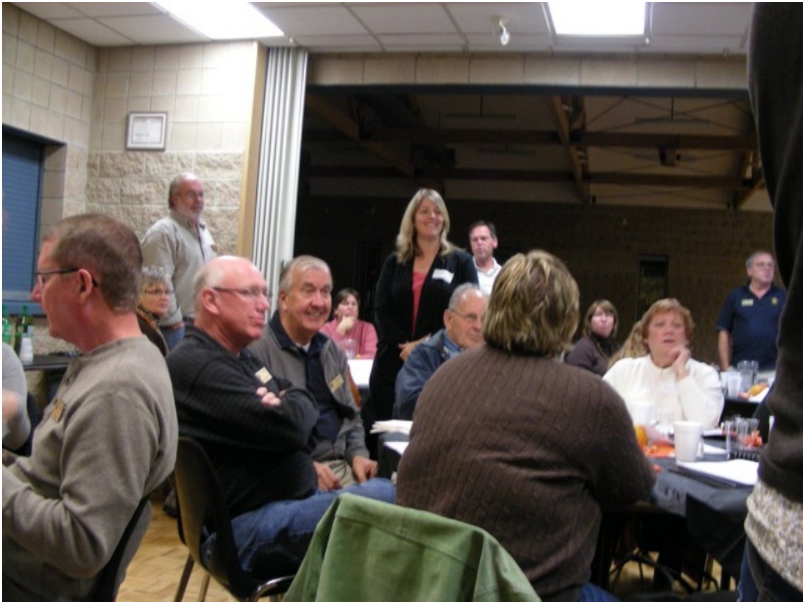
New Executive Members