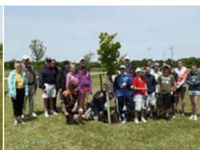
Tree planting for Optimist Earth Day around the world 06 June